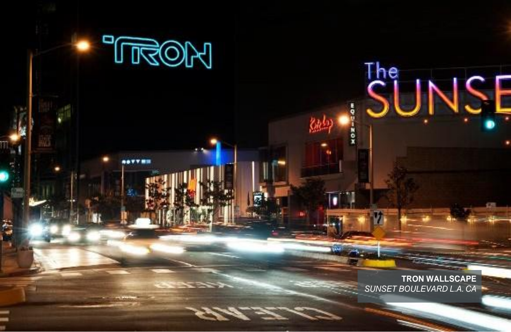
TRON WALLSCAPE SUNSET BOULEVARD L.A. CA